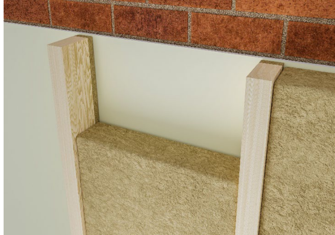
Diagram 1 - Typical detail of IndiTherm insulation installed between timber studs (incorporating 100 mm IndiBreathe Flex on 50 mm wide timber stud)